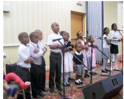
The COZ Children's Choir greets us with 'Melodies From Heaven.'