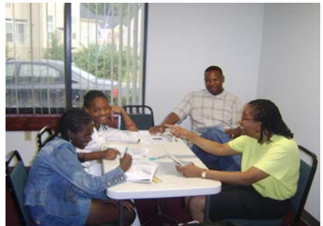
PICTURES OF THE FIRST BIBLE STUDY CLASSES IN OUR NEW BUILDING! - (WEDNESDAY, JULY 11, 2007)