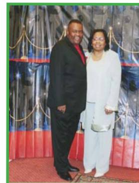
Pictured right: Several couples pose for Valentine's pictures at COZ's 2nd Annual Valentine's Gala.