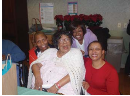
Disciples of COZ visit with residents at the Mariner Healthcare Center on Dec. 21, 2006.

In March, we attended the Praise II: Liturgical Dance Praise Festival held in Landover, Maryland. Members were