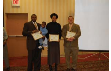
Turning Point members receive certificates for completing phases of the program.

intimate, and there is a strong emphasis on confidentiality.