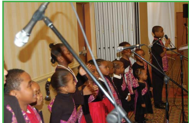
On February 11, COZ's Childrens Choir sang in tribute to Black History Month.