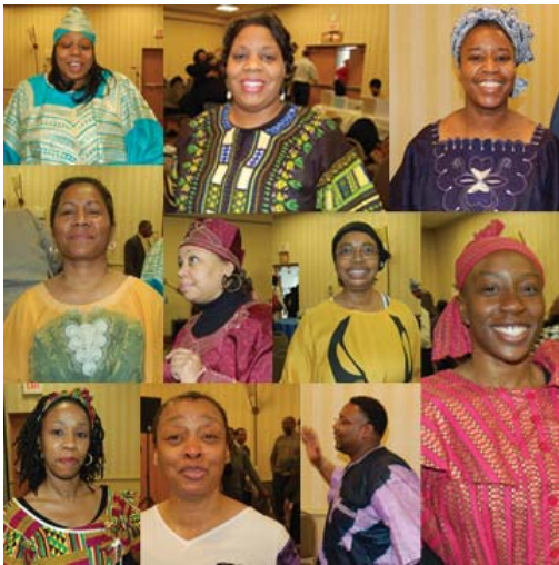
Disciples and Guest resplendent in traditional African garments for Black History Month.