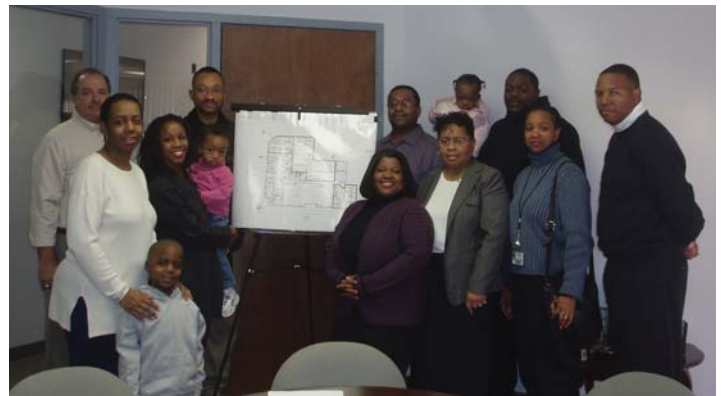
COZ Officers are pictured here with a representative from B&B, LLC, after signing the lease for City of Zion's future home.