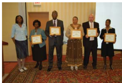
Turning Point members receive certificates for completing phases of the program.

If you are tired of self-destructive or unproductive behaviors ruling your life,