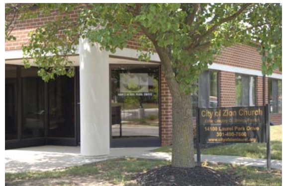
City of Zion's new home! See more pictures on page 2.